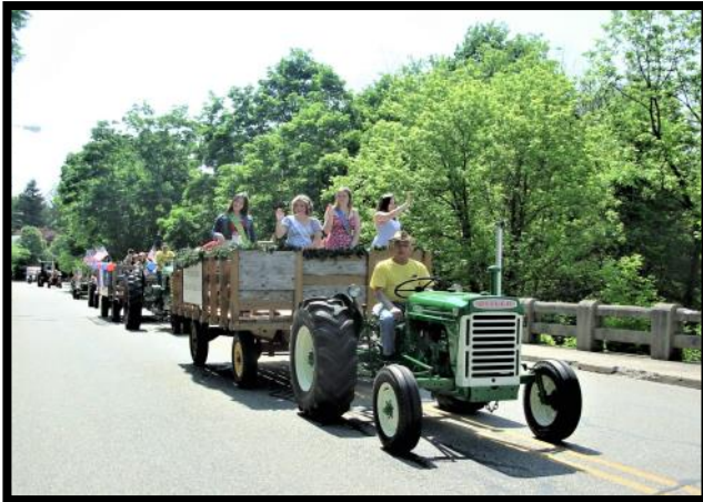
The Township Queens rode in our hay wagon!